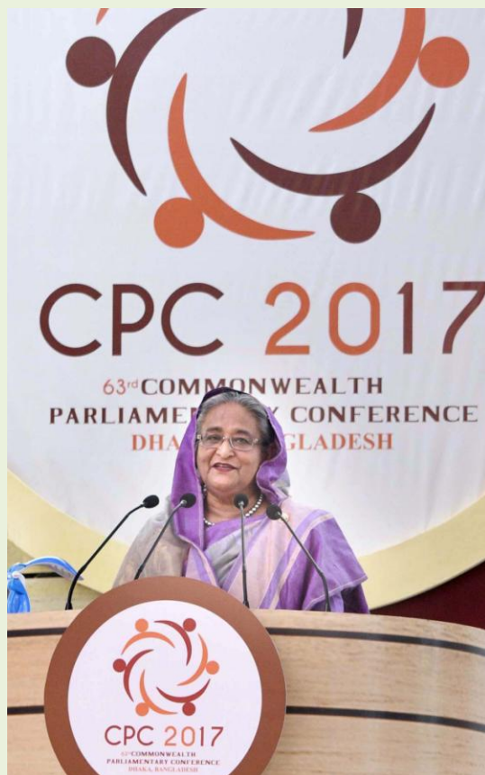
Prime Minister Sheikh Hasina addressing 63 rd Commonwealth Parliamentary Conference. South Plaza, Parliament Building. 5 November 2017

"I would like to request you all to discuss the Rohingya issue with utmost importance and exert pressure on the Myanmar government to stop persecution on its citizens and take them back at the earliest," Sheikh Hasina said while officially inaugurating the 63rd Commonwealth Parliamentary Conference (CPC) at the South Plaza on parliament premises on November 5.