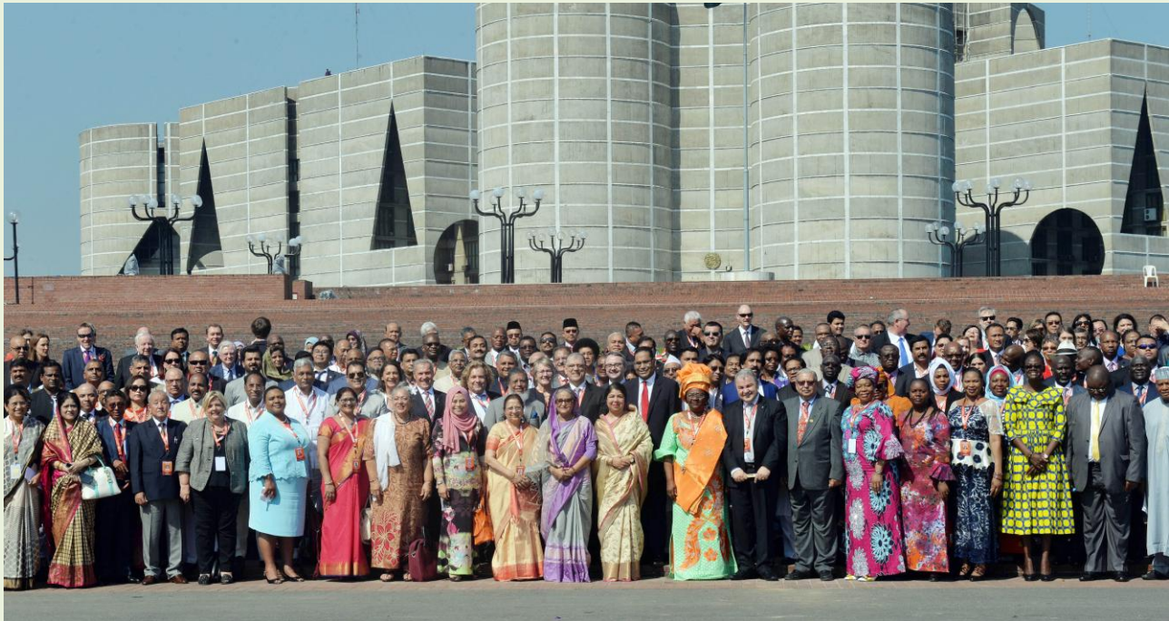
Prime Minister Sheikh Hasina with parliamentarians of Commonwealth countries. South Plaza, Parliament Building. 5 November 2017

Lawmakers from Commonwealth countries have called upon the international community to take urgent action to resolve the Rohingya crisis. The call was made at the 63rd general assembly of the Commonwealth Parliamentary Association in Dhaka.