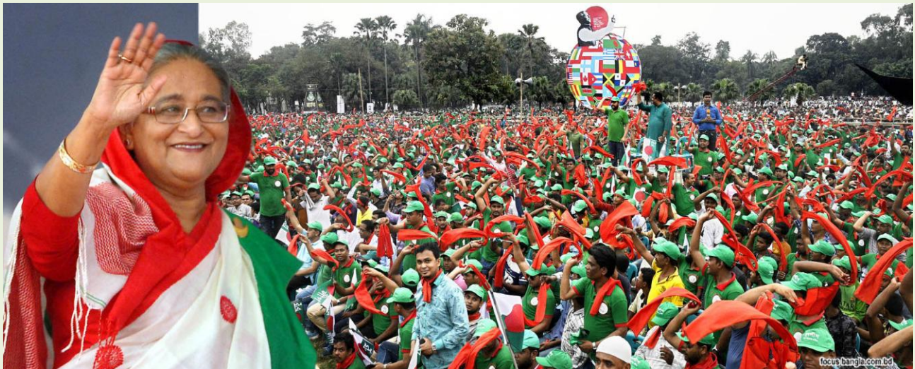
Prime Minister Sheikh Hasina addressing a rally organized by Nagorik Committee to celebrate Unesco's recognition of the 7 th March speech of Bangabandhu. Suhrawardy Udayan, Dhaka. 18 November 2017

In a statement the Prime Minister said, the recognition is a matter of great pride for the Bangalee nation and Bangla language. She termed the recognition as another milestone in the continuation of global acclamation.